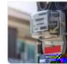
Centralized electricity meter reading