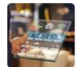
Power management system